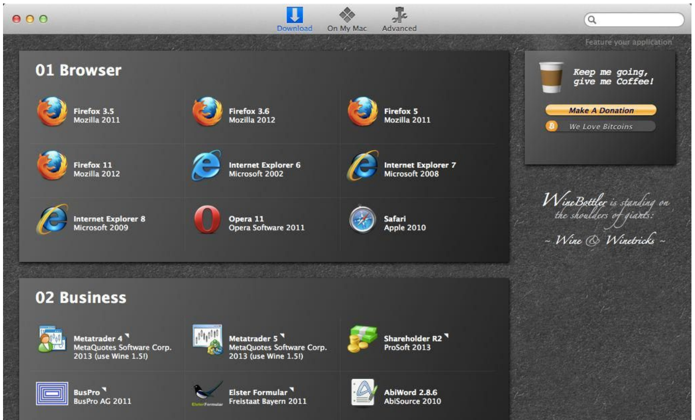
Software For Using Windows On Mac